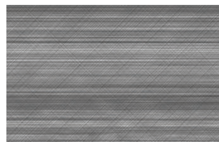
Eddy-current C-Scan, 101 inch wide.